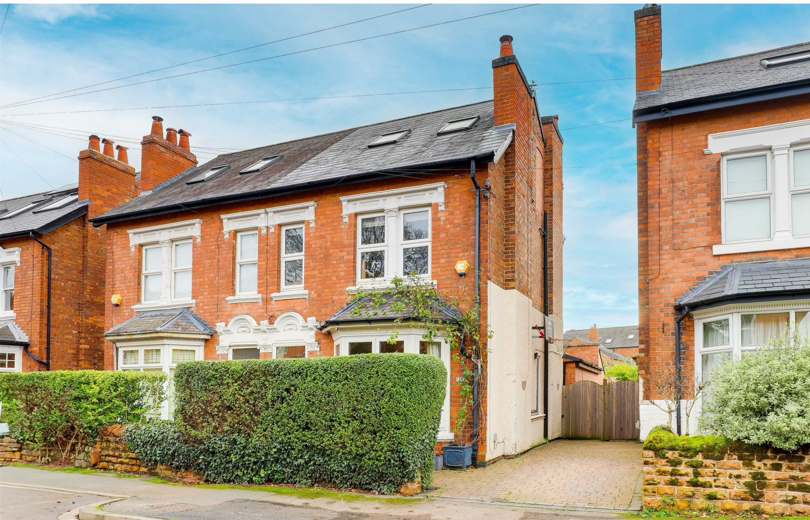
South Road, West Bridgford, Nottinghamshire NG2 7AG